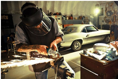
INDUSTRIAL & AUTOMOTIVE