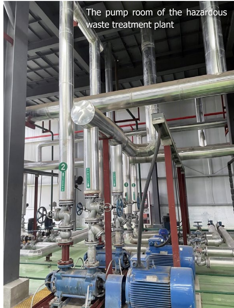
The pump room of the hazardous waste treatment plant