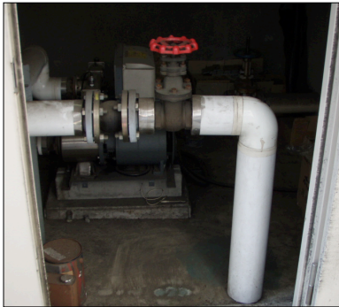
[Before installation of the Vulcan]