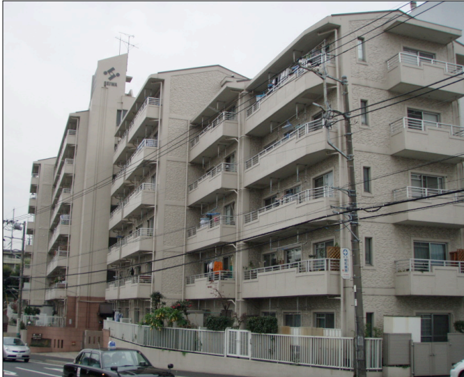
[Overall view of the apartment building]

Installation site: In the pump house at the side of the external water receptacle of an apartment building (built 19 years ago, with 50 houses), in Kanagawa Prefecture. The piping size is 65A.