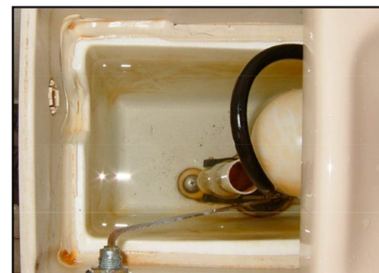
[Cleaned with sponge thirty minutes after the installation of the Vulcan]