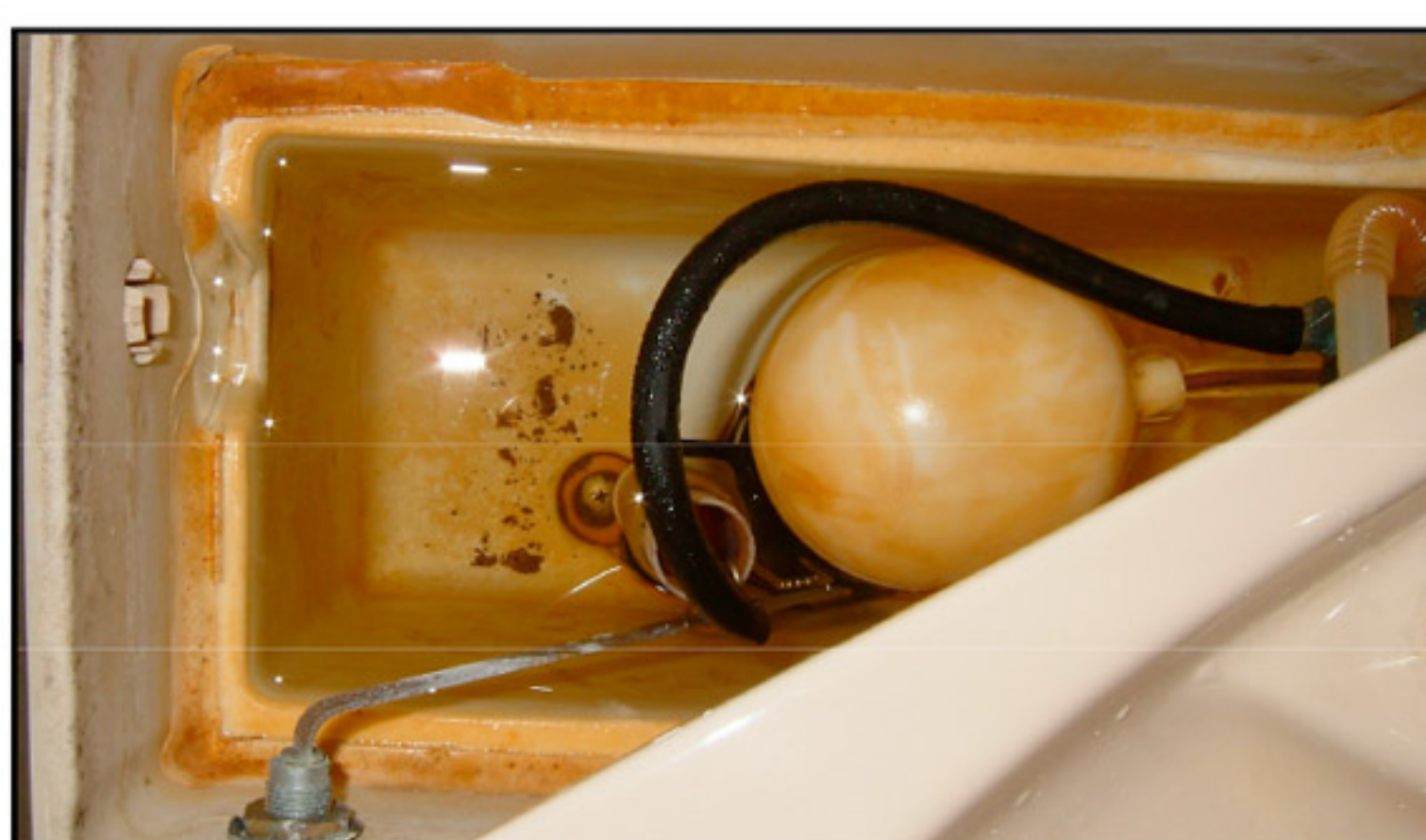
[Before installation of the Vulcan]