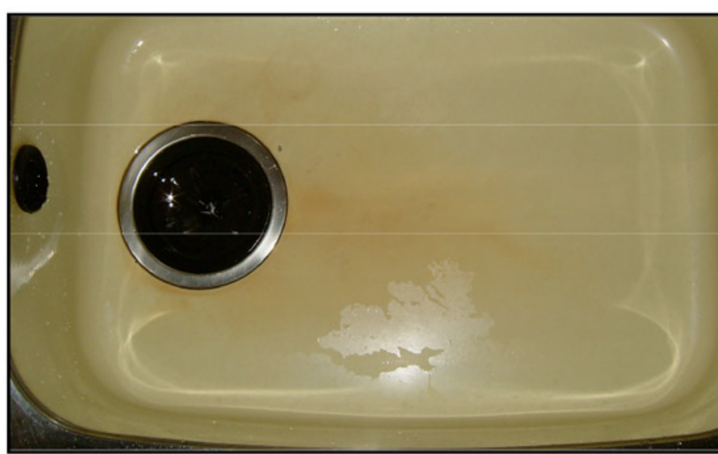
[Before installation of the Vulcan]