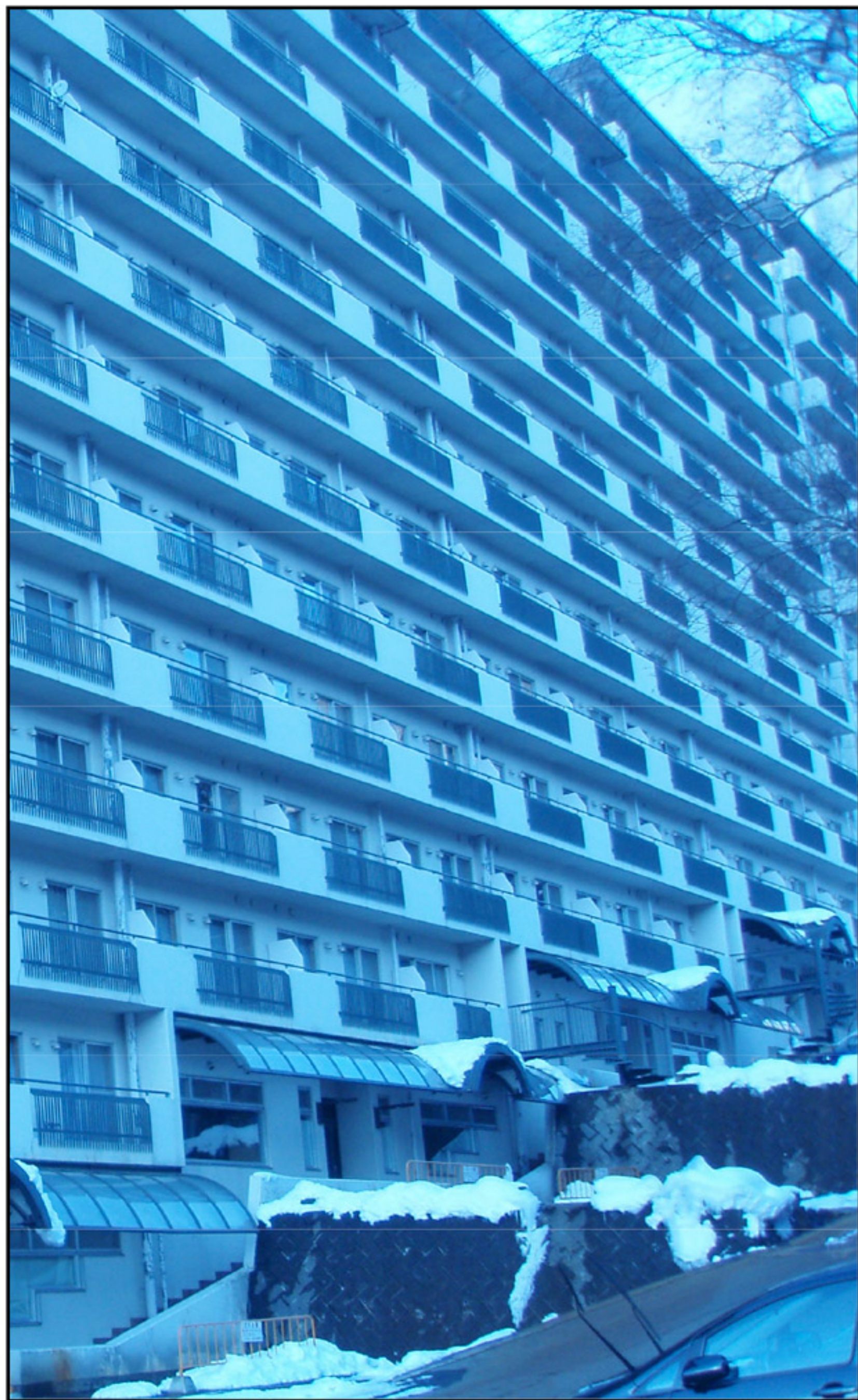
[Overall view of the apartment building]

Installation site: Piping space in a house of a resort condominium in Niigata Prefecture (Built 30 years ago having 420 houses, with piping size of 20A)