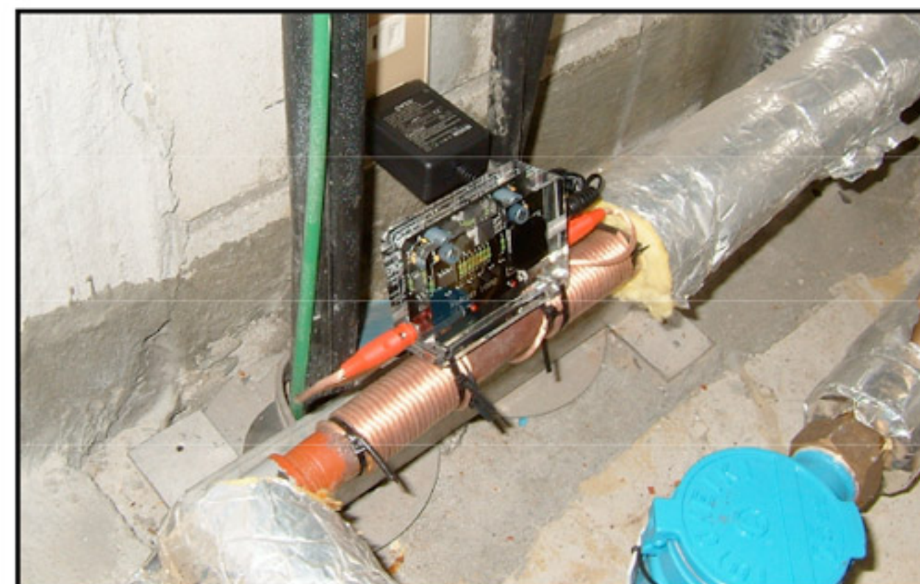
[Installation of the Vulcan completed]

The cover and the lagging material on the piping are removed and the cable is wound on the piping body.