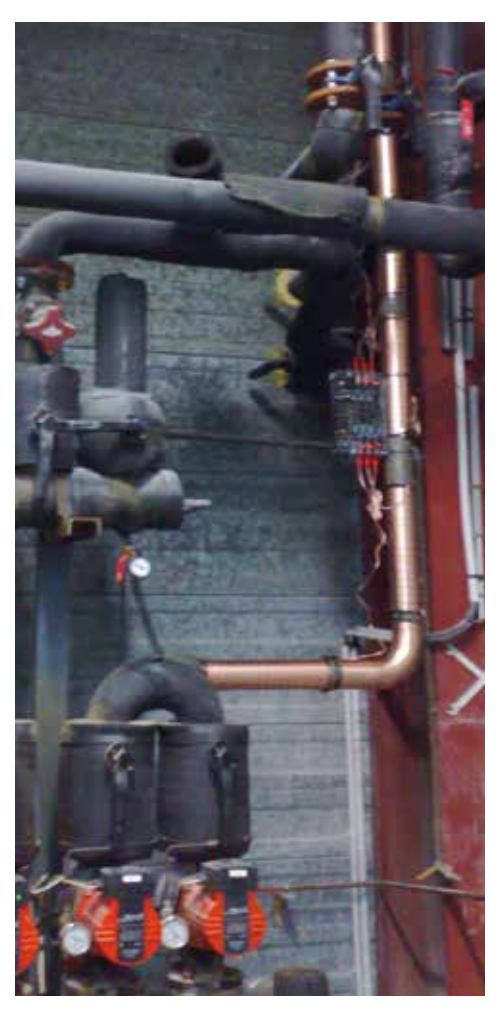
Vulcan S100 installed in Avignon Ceramic

Avignon Ceramic is an independent ceramic cores manufacturer for investment casting. With nearly 20 years of experience in design and production of ceramic cores, Avignon Ceramic offers a wide range of products, of various sizes and complexity levels from millimetres to nearly 1 meter, and from very simple to the most complex shapes.