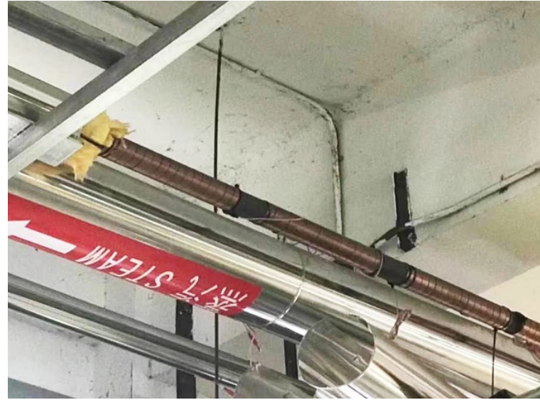
Step 1: Install the impulse bands ▼