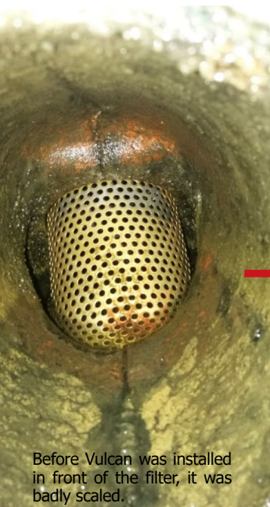
Before Vulcan was installed in front of the filter, it was badly scaled.