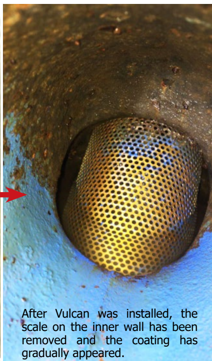
After Vulcan was installed, the scale on the inner wall has been removed and the coating has gradually appeared.