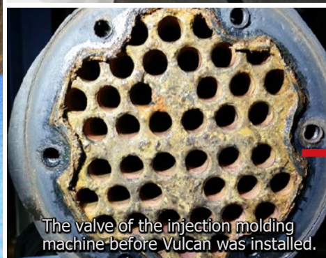
The valve of the injection molding machine before Vulcan was installed.