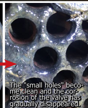
The "small holes" become clean and the corrosion of the valve has gradually disappeared.