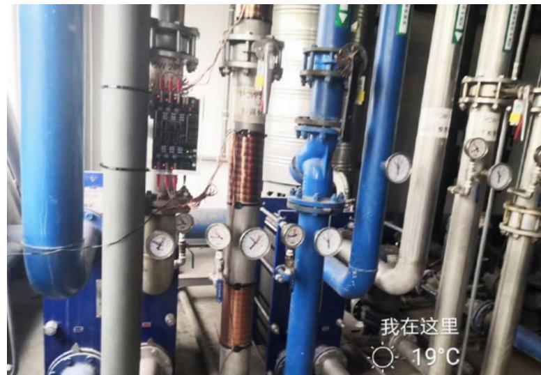
S100 was installed before the reheater.