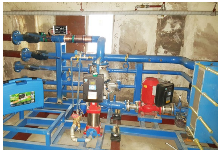
Vulcan S25 was installed in the water inlet of the heating system of the Building 131.