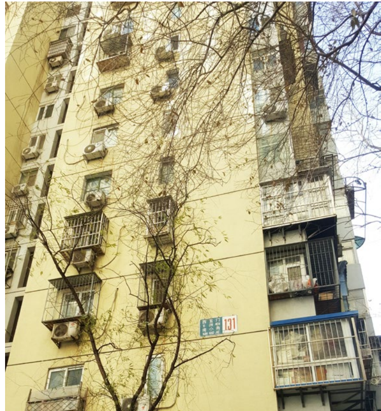
Xizhimen Building No.131, Beijing