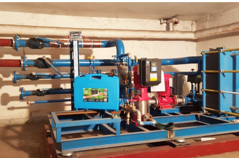
Vulcan S25 was installed in the water inlet of the heating system of the Building 129.