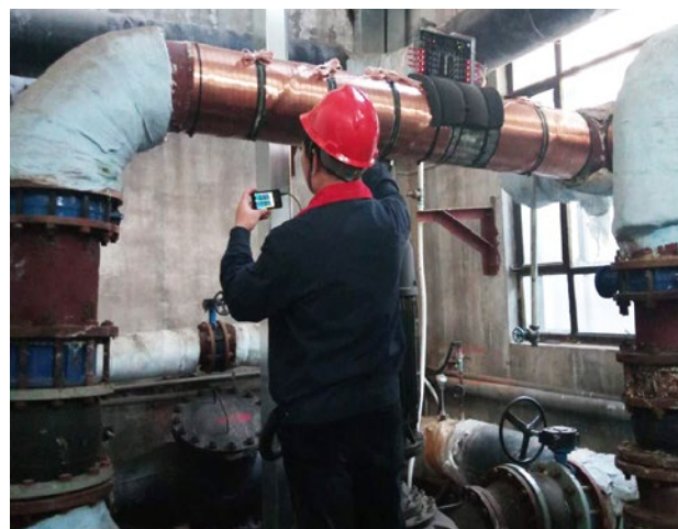
Vulcan S250 was installed on the inlet pipe.

The heat exchanger plates were cleaned before Vulcan S250 was installed. During the period with Vulcan, the water softener had not used also without any other water treatment. After the end of the heating period, the heat exchanger plates were opened and still clean.