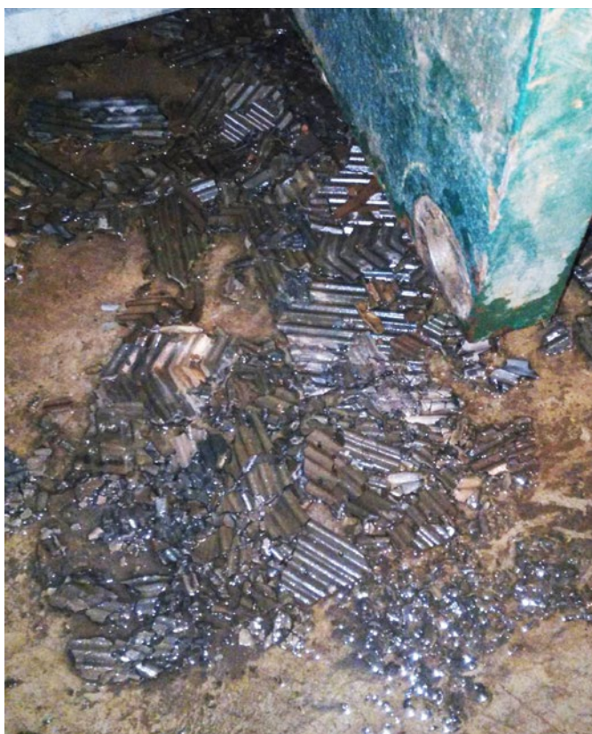
Without Vulcan treatment, the scale was removed after the end of the heating period.