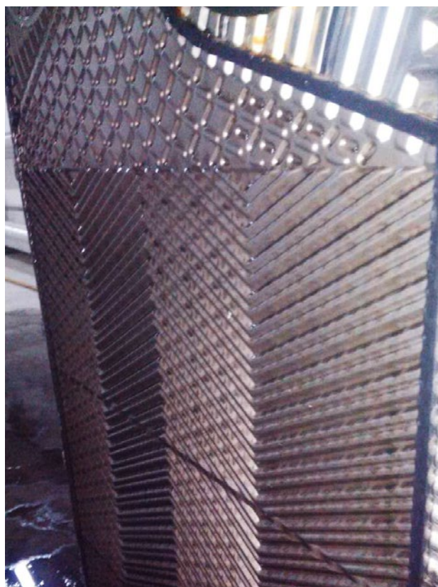
After installing S250 for 4 months, the heat exchanger plates were opened and remained clean.