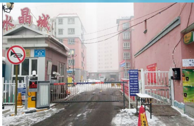
Crystal City Community