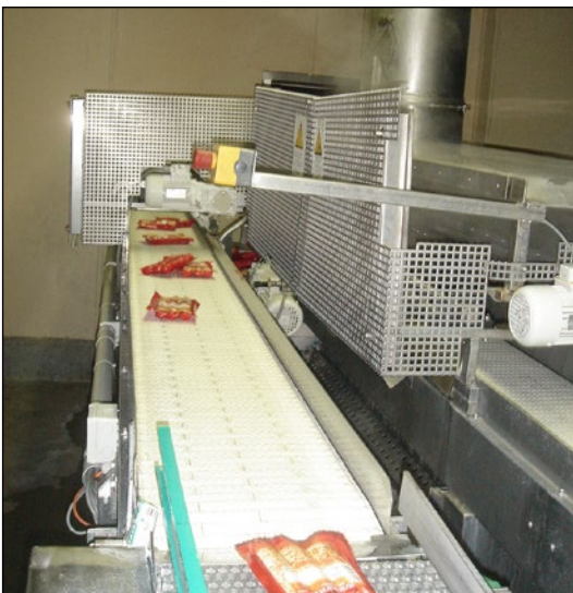
Sausage packaging line