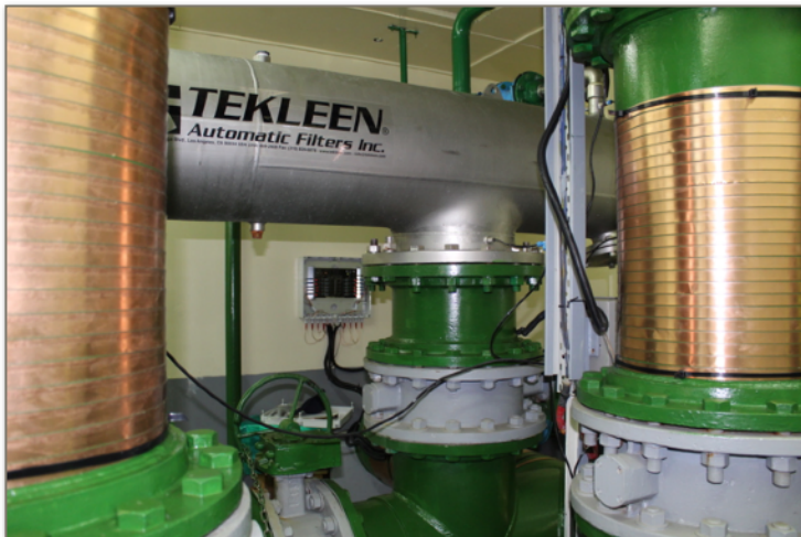
Vulcan S 500 unit installed in pump room