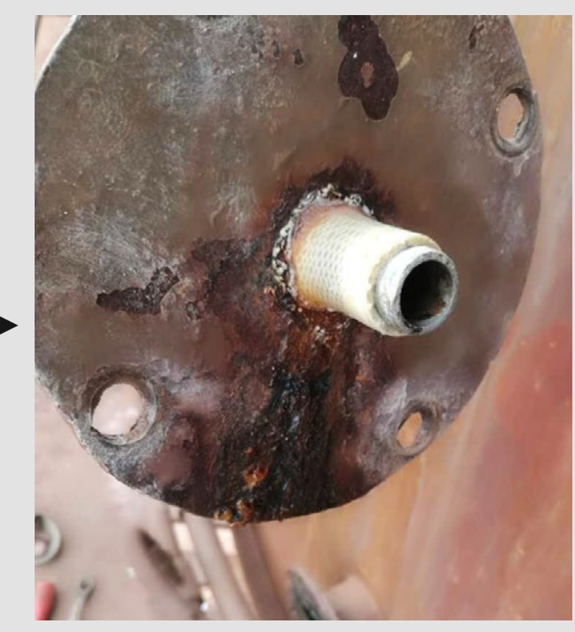
With Vulcan for 25 days, the scaling situation has already been greatly improved.