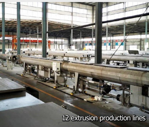
12 extrusion production lines

Result: Without Vulcan, the nozzles needed to be cleaned every 15 days. 30 days after installing the Vulcan S250, no new scale formation was seen on the nozzles.