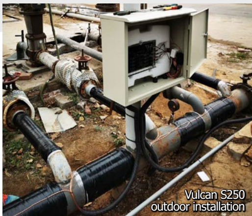
Vulcan S250 outdoor installation