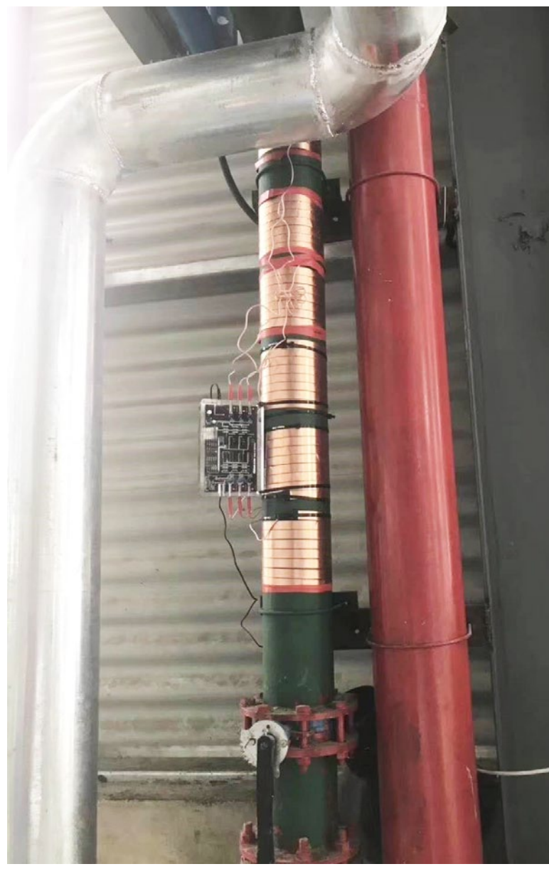
Vulcan S100 was installed on the main water inlet for the mold temperature machine