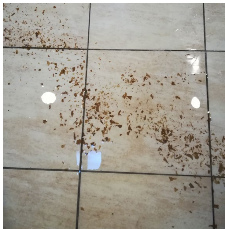
The scale scrap came out of the steamer in the Chinese kitchen.

The two steamers in the Chinese kitchen had been scaled badly, they had been corroded and damaged in 2 years. The client used to clean with acid once a month, but the steamed food had the taste of citric acid, and the acid would even damage the equipment. Therefore, the client is looking for an efficient way to remove the scale without bad odour after cleaning.