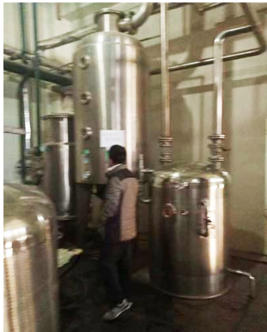
The cooling tank of Chinese medicine liquid.

In the process of producing traditional Chinese medicines, it is necessary to cool the liquid. Since the plate was scaled badly and affected the heat exchange efficiency of the condenser, it was necessary to open the plate for cleaning every six months.