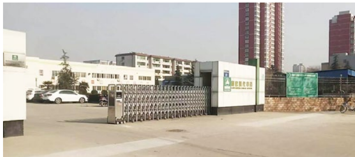
Lijun Chinese medicine factory.

Lijun Chinese Medicine has a long history of more than 300 years. The company was formerly known as "Hengxintang Pharmacy", which was founded in the late Ming Dynasty. Nowadays, it specializes in R&D, production and sales of Chinese medicines.