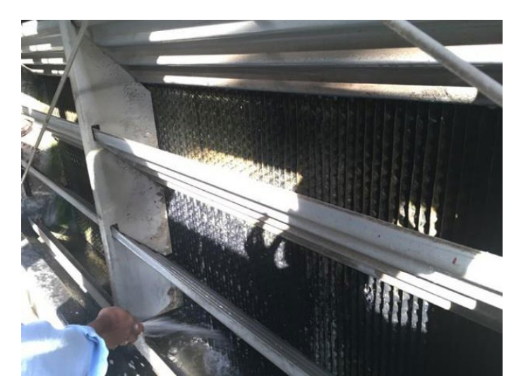
Scale and algae can be removed easily by a water gun.