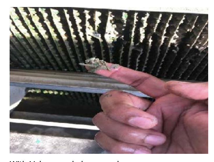
With Vulcan, scale becomes loose.