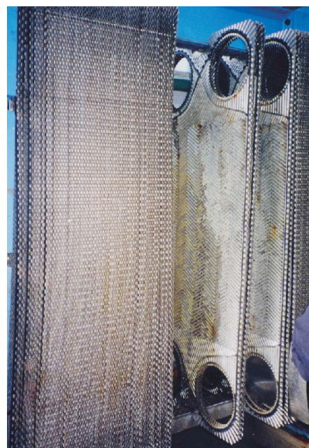
Control of honey comb fill of cooling tower

ENERGETIKA RAVNE d.o.o. RAVNE NA KOROŠKEM ①