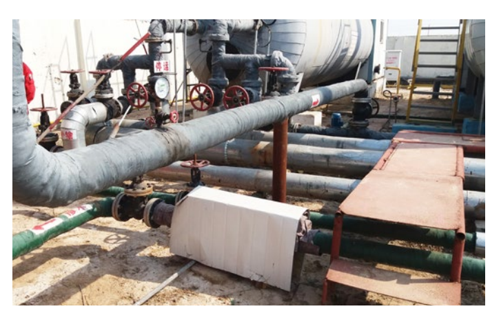
Outdoor installation with self-made cover, to protect the unit from the wind and sun.