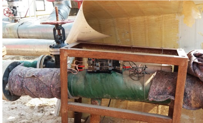
Before installing Vulcan, the rust and pipe insulation were removed, and the impulse bands were winded on the pipe. Then, the outer insulation was put back.