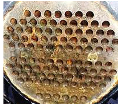
June 3, 2015