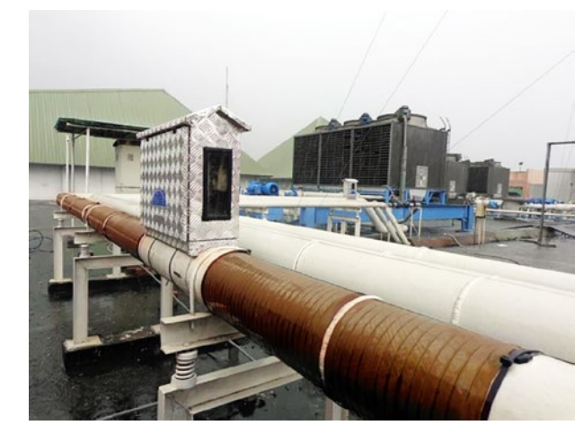
Vulcan S500 was located inside aluminum box and installed on a cooling tower main pipe in Supermal Karawaci.