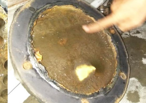
Inside of heat exchanger. Condenser end plate had lost all scale that was there previously. (Light spot at bottom is reflected light.)