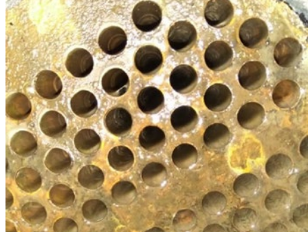
October 27, 2016