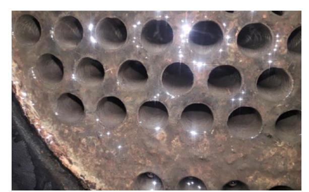
August 3, 2017