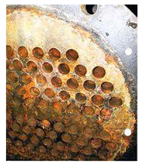
June 1, 2014