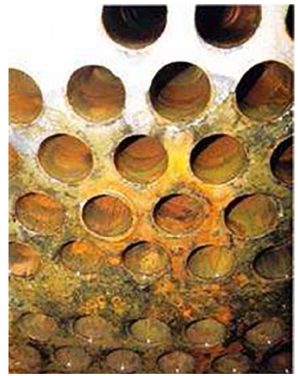
First Inspection: March 4, 2014