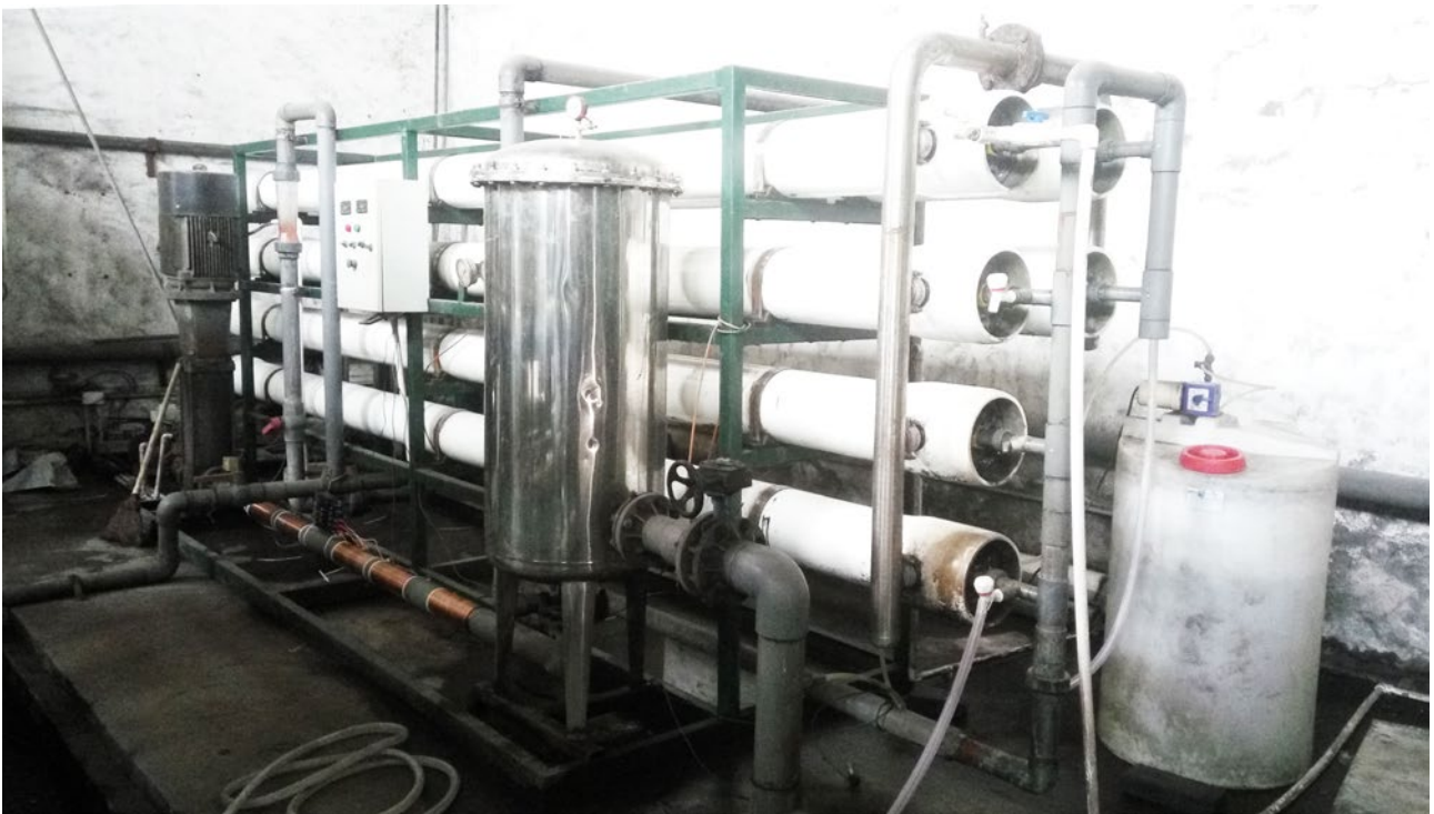
Vulcan S100 was installed in the reverse osmosis membrane inlet.