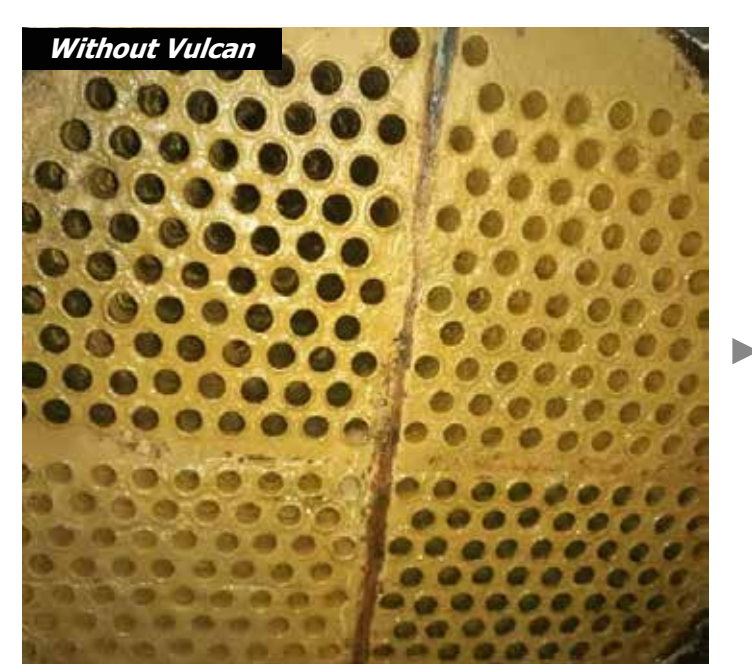
Before installing Vulcan, the scale was very thick and hard in the heat exchanger tubes.