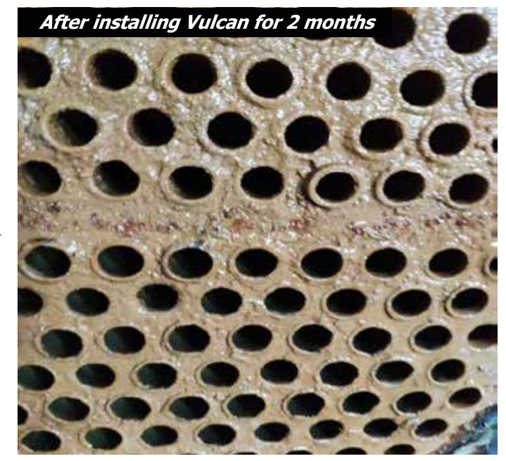
The scale becomes soft and muddy.