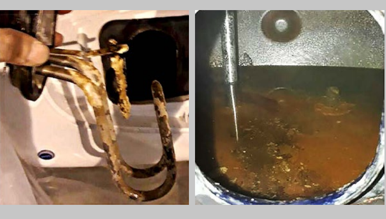
Pictures 4 & 5. Three weeks after Vulcan installation, initial scale has been eliminated.

Scale gradually disappeared from the elements and reservoir sump. After 3 months scale is entirely gone from water heater elements and the reservoir sump.