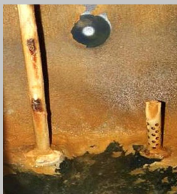
Pictures 6 & 7. Twelve weeks after Vulcan installation, no scale at all.