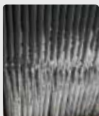
Cooling tower grids