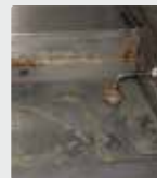
Grill plate in a kitchen